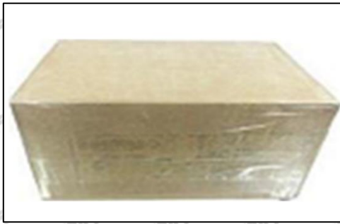
Pic No. 1